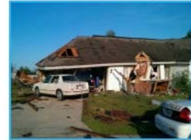
Damage to a house in Macon (Bibb County).