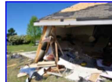
Garage Destroyed by Tornado in Bibb County.