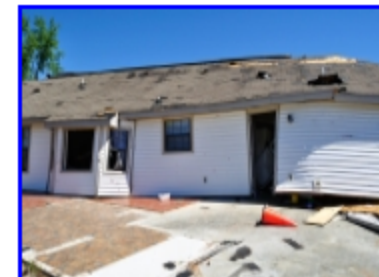
House Shifted off Foundation by Tornado in Bibb County.